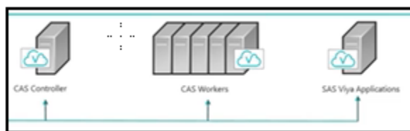
Figure 2 Distributed SAS Viya Installation [2]

In the Distributed configuration of SAS Viya you have multiple machines configured for CAS. This allows for parallel processing of SAS operations across multiple CAS Worker Nodes.