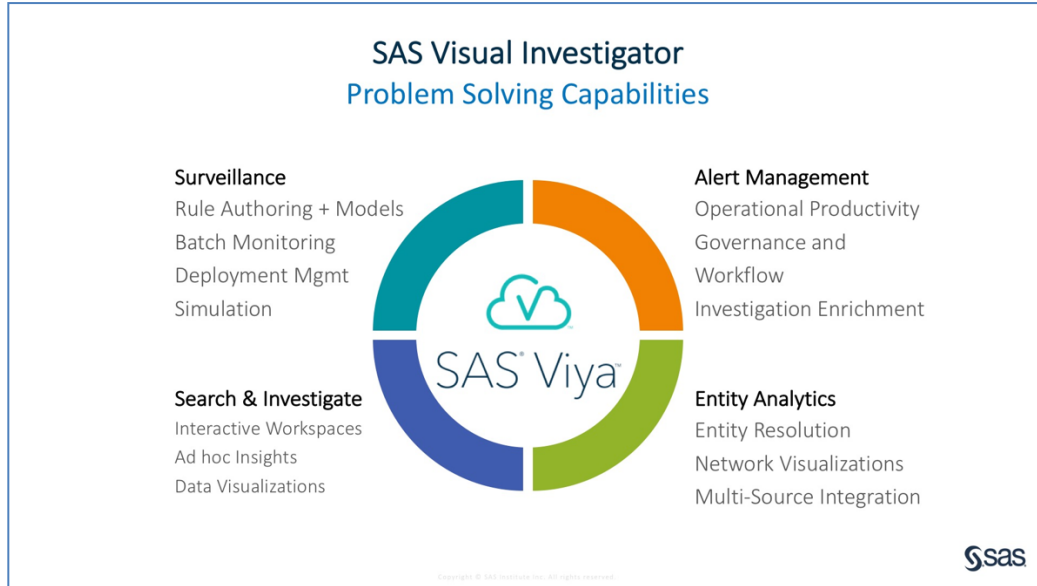
Figure 4: SAS® Visual Investigator capabilities as used by the intelligence analyst