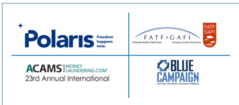
Figure 1: Logos of the Primary Organizations and/or Programs from Which a Significant Portion of This Document Content Is Derived. Clockwise from Top Left, Polaris, prior and current Financial Action Task Force/Groupe d'action financière (FATF/GAFI), Department of Homeland Security (DHS) Blue Campaign, and Association of Certified Anti-Money Laundering Specialists (ACAMS).

In this session, we introduce THB referencing both the Polaris' Typology document and DHS' Blue Campaign, discuss some of the case studies yielding FATF's red flag indicators, and you learn about how SAS® Visual Investigator can incorporate combatting THB into a money laundering program's scenarios, alert generation, and investigations.