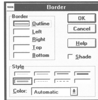
Figure 7. The BORDER command in Figure 6 is exercised below. SAS code is indigo; X4ML is plum. X4ML uses positional parameters in function calls. See numeric annotations below for contextual interpretations of consecutive commas.

Shade corresponds to the Shade check box in the Border dialog box of Microsoft Excel version 4.0. This argument is included for compatibility only.