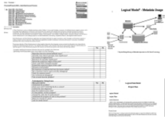
Figure 2. Formal Methodologies Combine Approaches with Tools and Techniques

A prime example of this approach is one where the methodology traces to specific processes that are implemented – complete with tools and technologies (templates) to support the methodology.