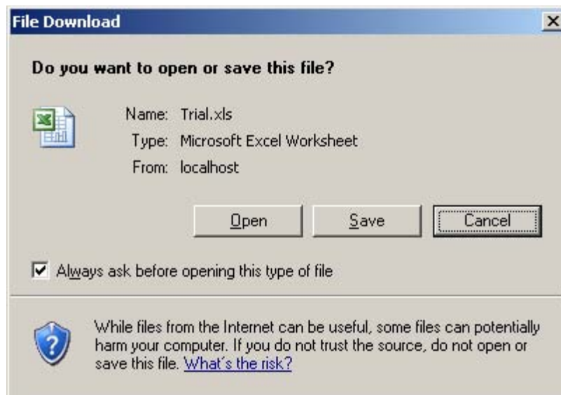
Figure 6. File Download Dialog Box

This is just one example of how you can dynamically deliver SAS output to Excel. For more detailed information and other examples, refer to the SAS/IntrNet Application Dispatcher and/or Stored Process documentation, as well as this author's earlier papers (DeIGobbo, 2002, 2003, 2004).