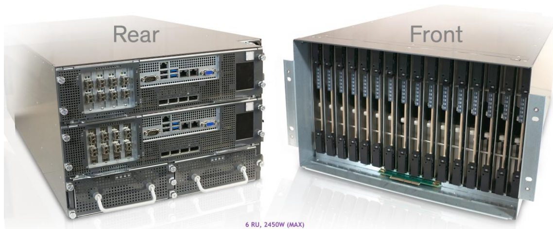
Vexata Storage System (Left (rear), Right (front))