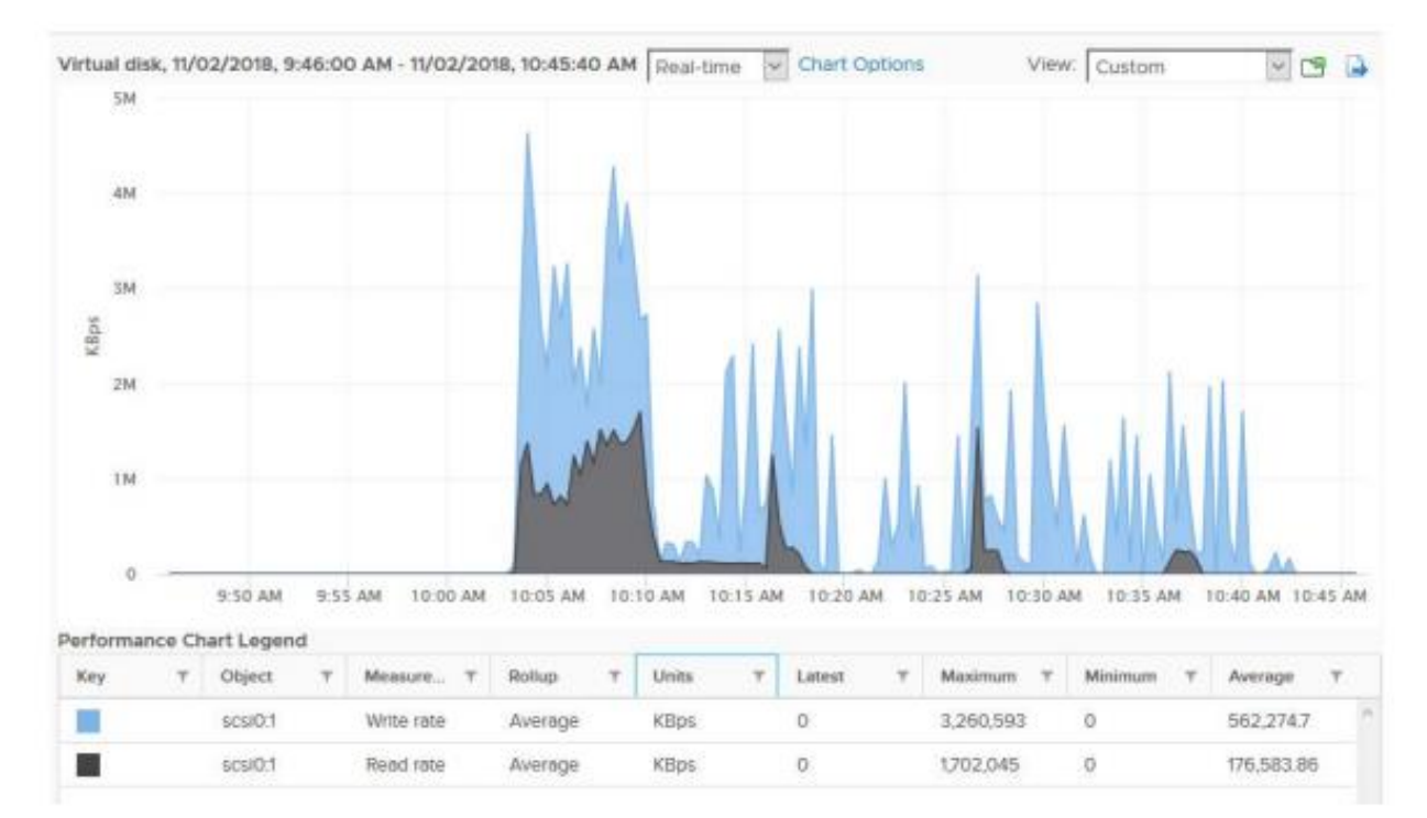
Graph 2 - Read and Write Bandwidth