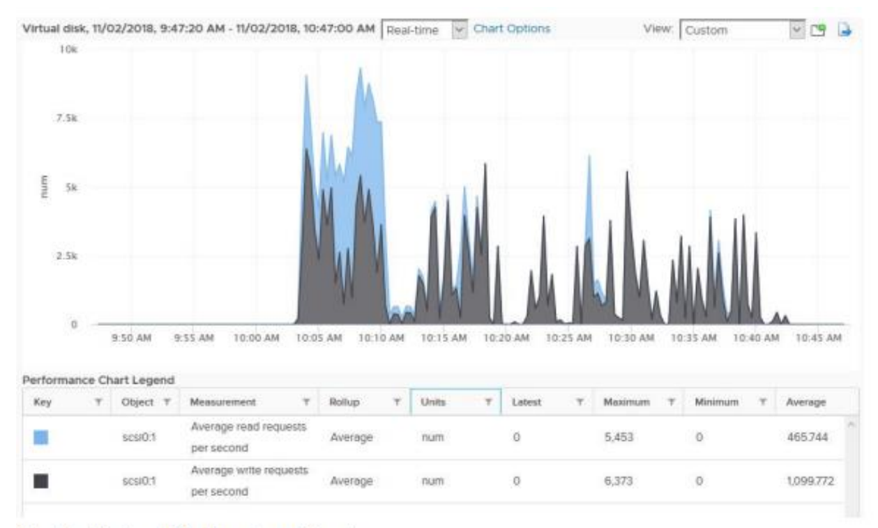
Graph 4 - Read and Write Requests per Second