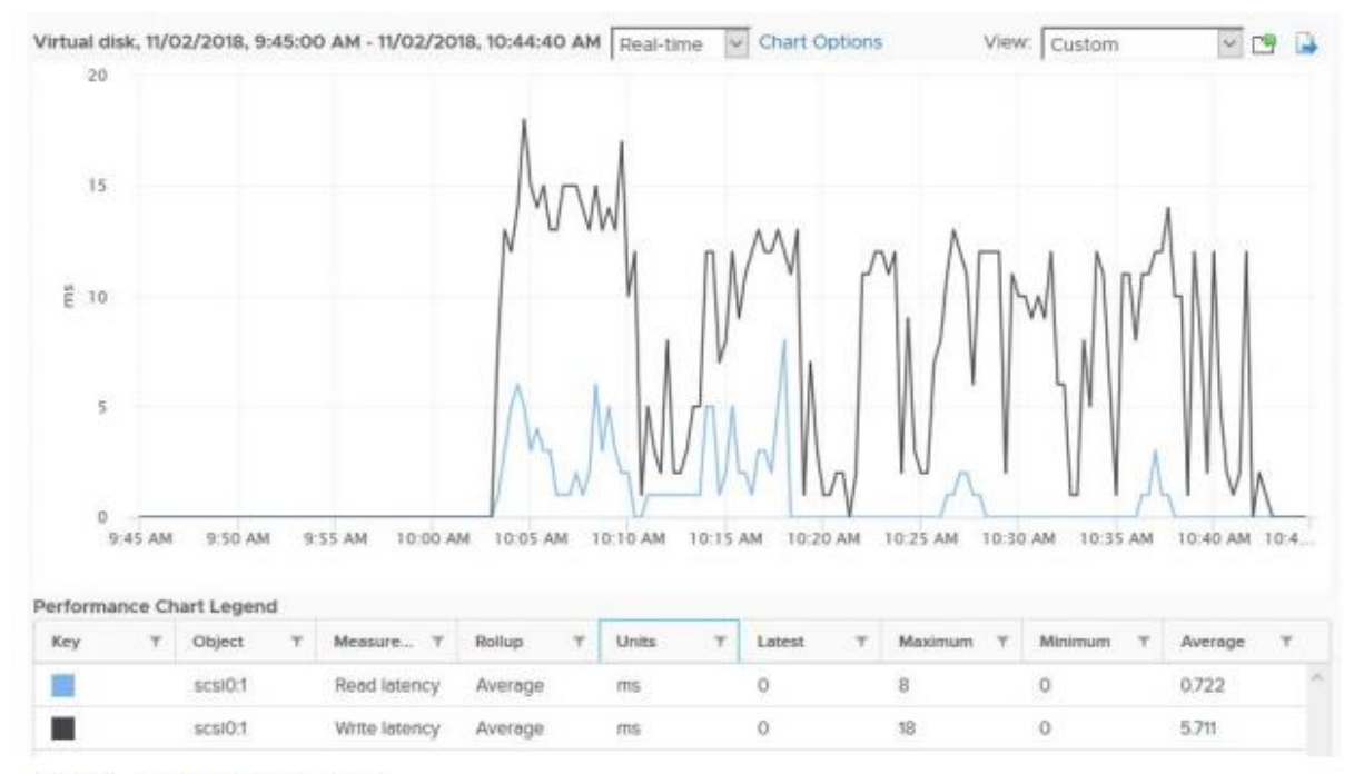
Graph 1 - Read and Write Latency

The following graphs (Graphs 1–4) show ESXi performance from a single node run and with reports on virtual disk latency, bandwidth, and transaction request rates. Write latency (from the scale-out storage devices) ranges somewhat on the high side from 12 to 18 milliseconds (ms) per transaction. This is not totally unusual for scale-out, replicated flash storage. The trade-off is acceptably commensurate with the 4.7 GBs of I/O bandwidth achieved. It takes 24 cores to run the mixed analytic 20 workload, yielding an average rate of 210 MBs per second, per core. This significantly exceeds the 150 MBs per second, per core recommendation for SAS 9.4 file systems.