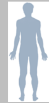
ILLUSTRATION OF HAZARD RATIO