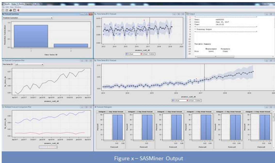
Figure x – SASMiner Output