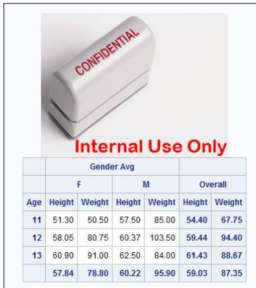
Figure 19: Preimage before Report Table

Turn Your Plain Report into a Painted Report, continued