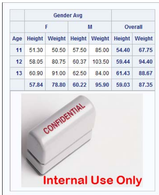
Figure 20: Preimage after Report Table

compute after / style={preimage="confidential.png"}; line ' '; endcomp;