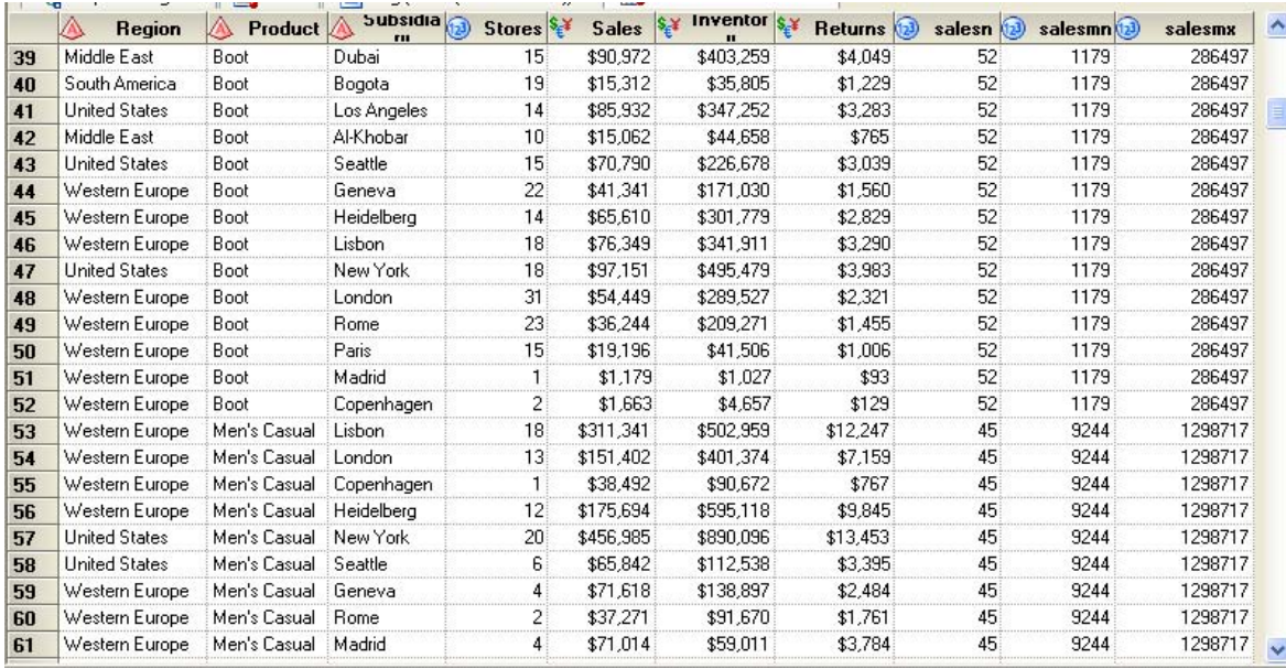
Output 5. PROC SQL WITH GROUP DESCRIPTIVE STATISICS BASED ON ANOTHER VARIABLE

For a visual representation of Proc SQL's suq-queries, see the mind map below. This mind map is part of a larger collection of interrelated mind maps. For this and other free SAS mind maps, visit <a href="www.SASSavvy.com">www.SASSavvy.com</a>.