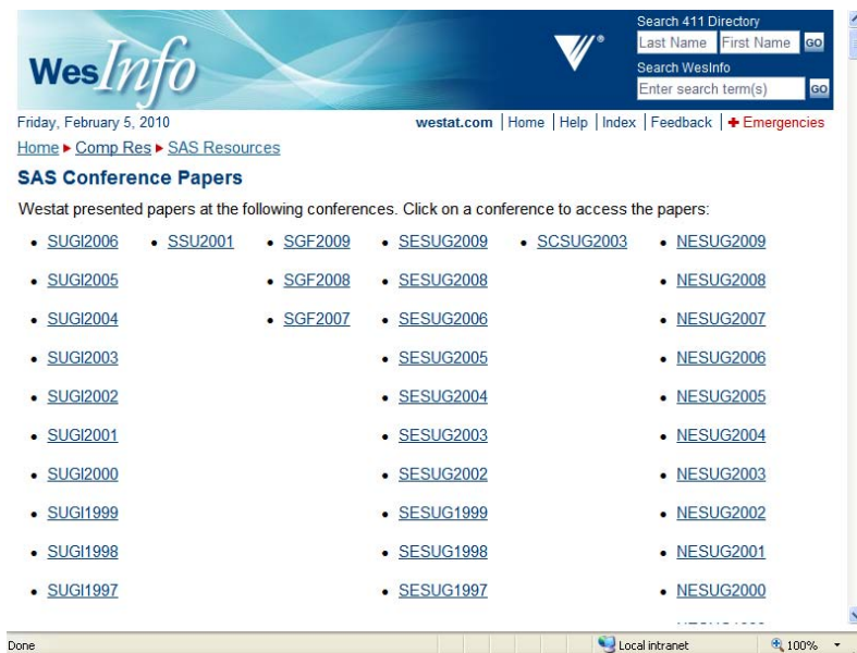
Figure 3 – Index of SAS conference papers on the corporate intranet.

Staff who have had papers accepted by a SAS user group conference must present their papers to their peers at a WesSUG meeting prior to the conference. After the conference, the papers are posted to the SAS Resources pages on the corporate intranet. (See Figure 3). All conference attendees must prepare a brief presentation on their favorite tips, techniques, or papers from the conference. They then present this information to their peers at a WesSUG meeting held after the conference. This cycle of internal presentations ensures that SAS-based information going to and coming from a particular conference is shared with all interested members of the organization.