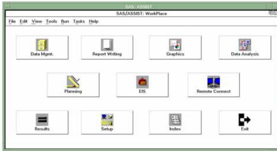
Display 1.1 WorkPlace Menu